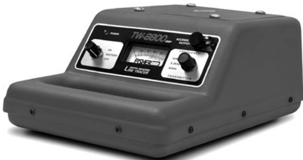
The TW-8800 Transmitter.

WARNING: Do not connect output leads to a live (energized) utility. Please prevent shock hazard and equipment damage.